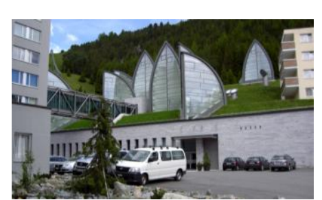
The completed green roof.