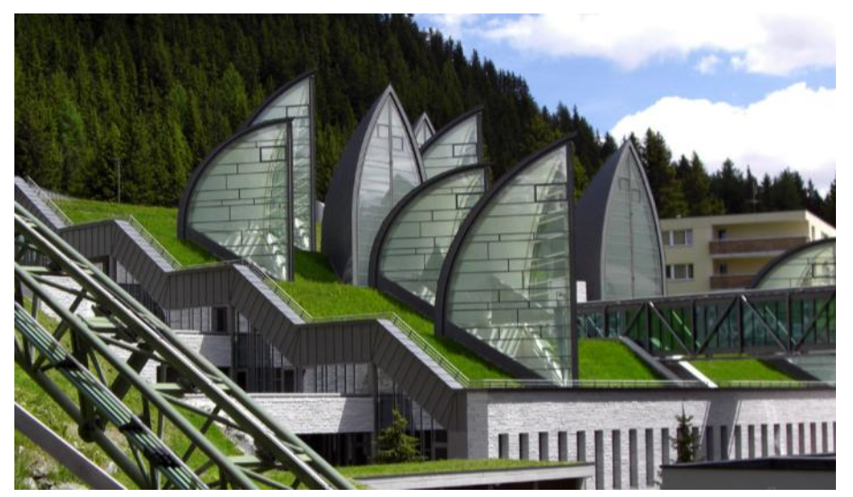
The eight light sails – a construction made of steel and glass.