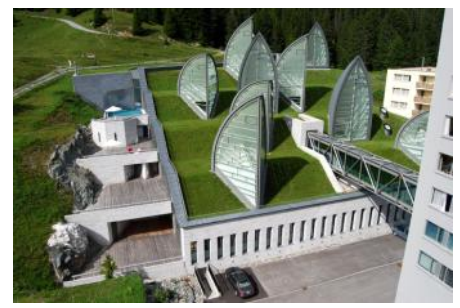
The light sails, each of them up to 13 metres in height.

Roof build-up with root resistant waterproofing and thermal insulation made of extruded polystyrene